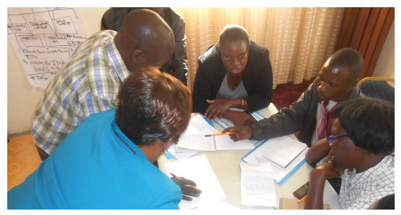
Health centre committee dialogue, Zambia

At the same time, divergent interests and power relations amongst those involved can affect evaluation processes. The motivations may differ between the community members, service personnel; funders and managers in programmes. They may also have different power to determine, produce and use the results raising questions of how representative, accessible and meaningful the process and conditions are, including to address power differences during data collection and analysis (Guijit 2014; NIH 2011). It is thus important to identify these social groups and their interests, motivations and power early, to be transparent on how this affects the decisions on and design of evaluation processes (Community tool box 2017).